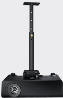
DELL UNIVERSAL CEILING MOUNT FOR DELL PROJECTORS