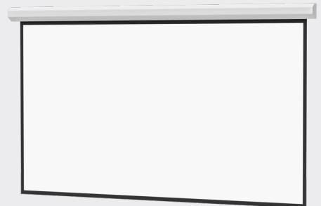
CHIEF COSMOPOLITAN PROJECTOR SCREEN 133"

1 Laser life of 10 Years assumes 8 hours usage every working day.