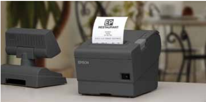
Epson TM-i POS: Neat, mobile and compact