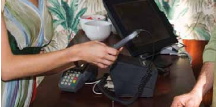
Conventional POS: Cluttered and messy

With the Epson TM-i series printers, no PC is required. A POS transaction system could be as simple as a single smart mobile device wirelessly connected to a single TM-i printer! This allows for efficient space usage and a clutter-free working environment.