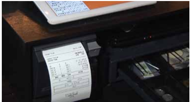
Epson TM-i at cashier counter acts as a printer hub and prints final receipt

The Epson TM-i printers offer a low cost method of adding web application printing capability to small networks without the need for additional PCs, and are able to host web application databases stored on MicroSD cards.