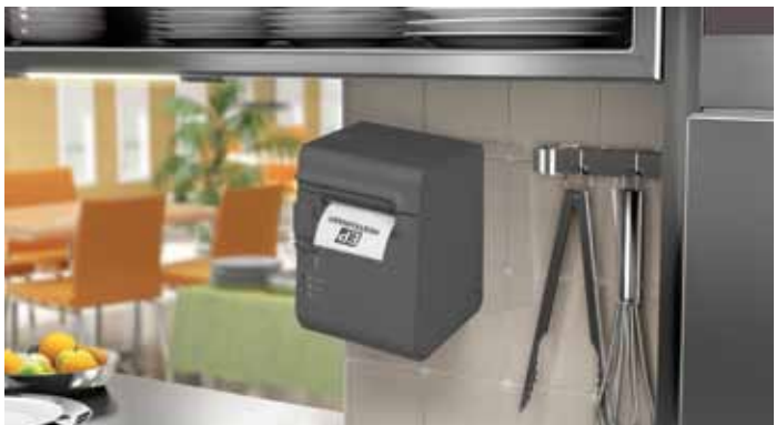
Client printer in kitchen prints order information for food preparation