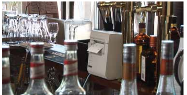
Client printer at bar prints drink orders for drink preparation